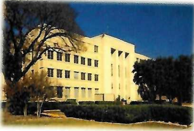
HOWARD COUNTY OFFICES Howard County, Texas